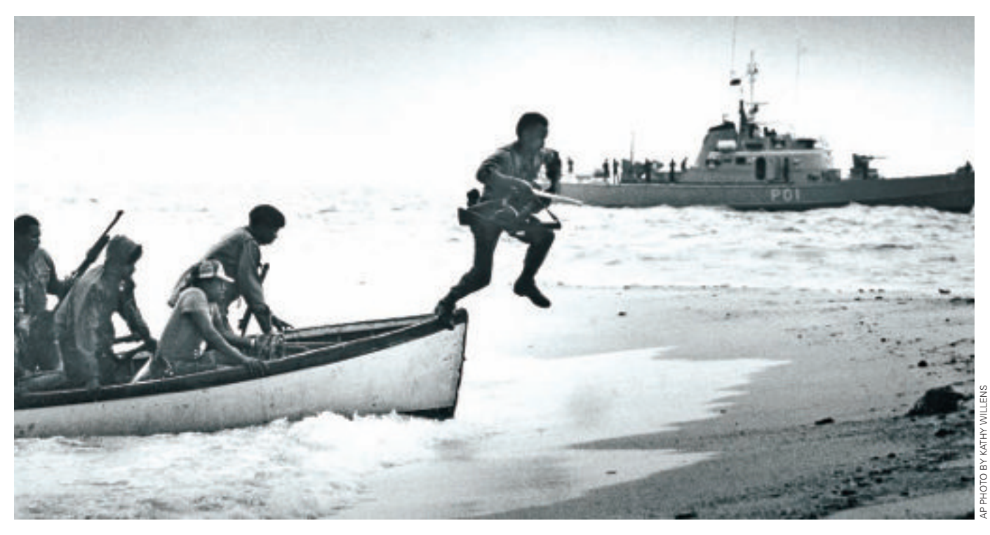
This page: Bahamian police storm the beach at Cayo Lobos. Opposite page: Haitian refugees were stranded at Cayo Lobos for more than a month